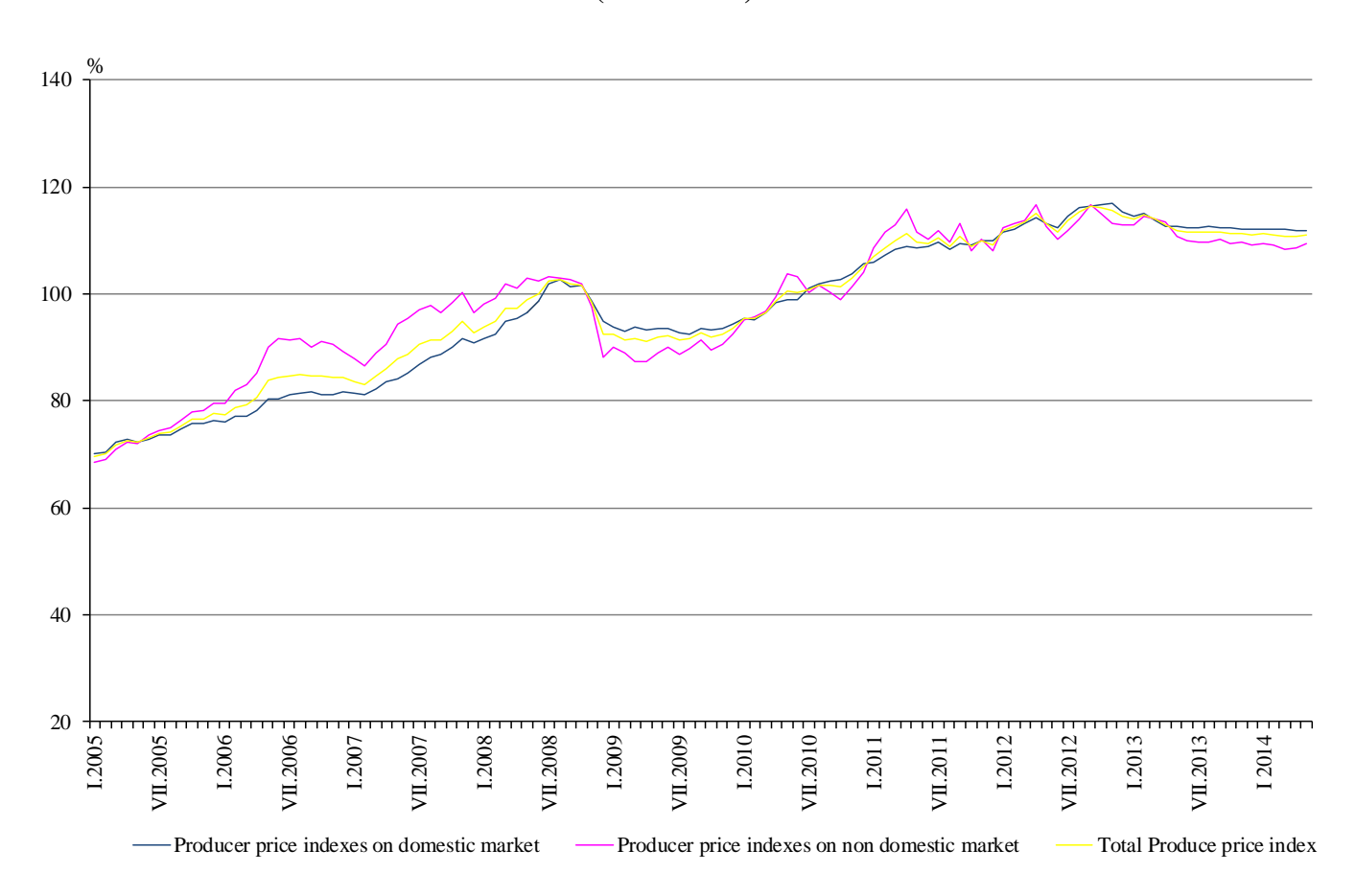
Figure 2. Total Producer Price Indices in Industry (2010 = 100)

In the manufacturing, the prices fell by 0.2% as compared to May 2013. More significant prices decreases were seen in the manufacture of basic metals by 6.3%, in the manufacture of chemicals and chemical products by 5.1%, and in the manufacture of food products by 4.3%, while the producer prices rose in the manufacture of tobacco products by 5.3%, in the manufacture of beverages by 2.2%, and in the manufacture of furniture by 2.1%.