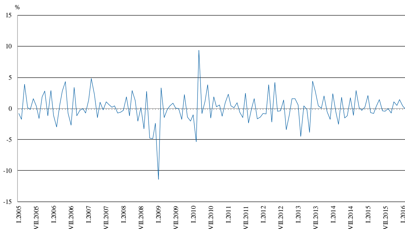
Figure 2. Changes of Industrial Production Indices compared to the previous month (Seasonally adjusted)

The most significant increases of production in the manufacturing were registered in the manufacture of chemicals and chemical products by 9.3%, in the manufacture of other transport equipment by 8.9%, in the manufacture of wood and of products of wood and cork, except furniture; manufacture of articles of straw and plaiting materials and in the manufacture of paper and paper products by 7.9%, in the manufacture of textiles by 7.7%. There were decreases in the manufacture of fabricated metal products, except machinery and equipment by 17.3%, in the repair and installation of machinery and equipment by 11.9%, in the manufacture of tobacco products by 3.3%.